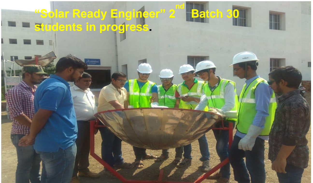
“Solar Ready Engineer” 1 st Batch 54 students trained for 120 Hrs Course.