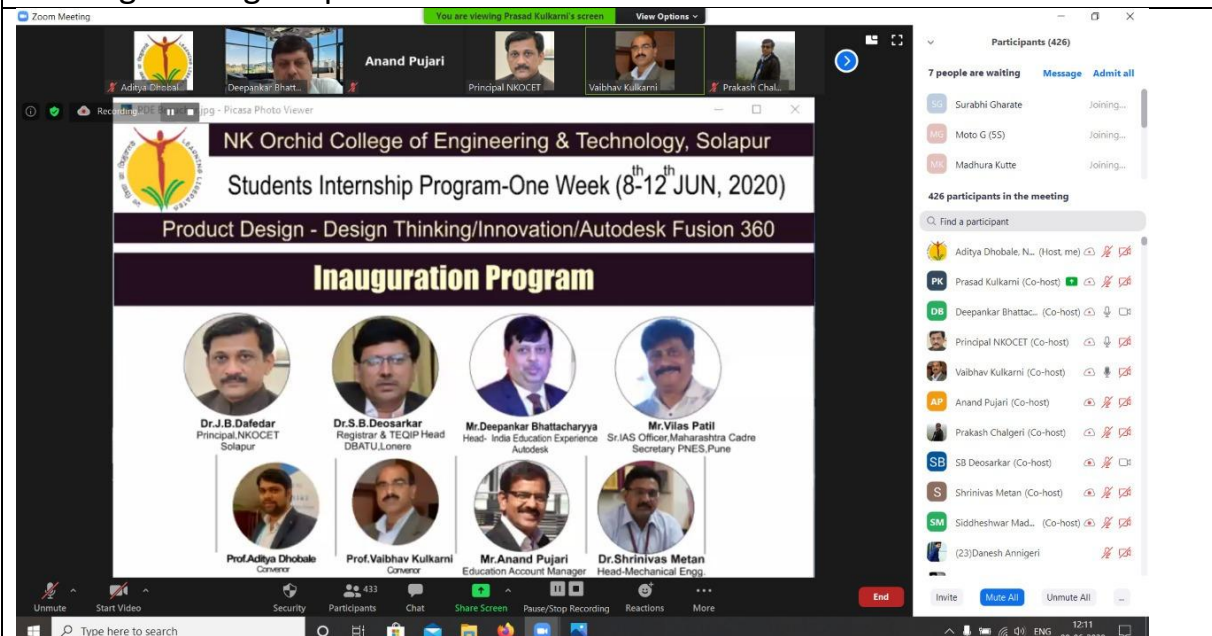
One Week Internship Program organised by Mechanical Engineering Department.