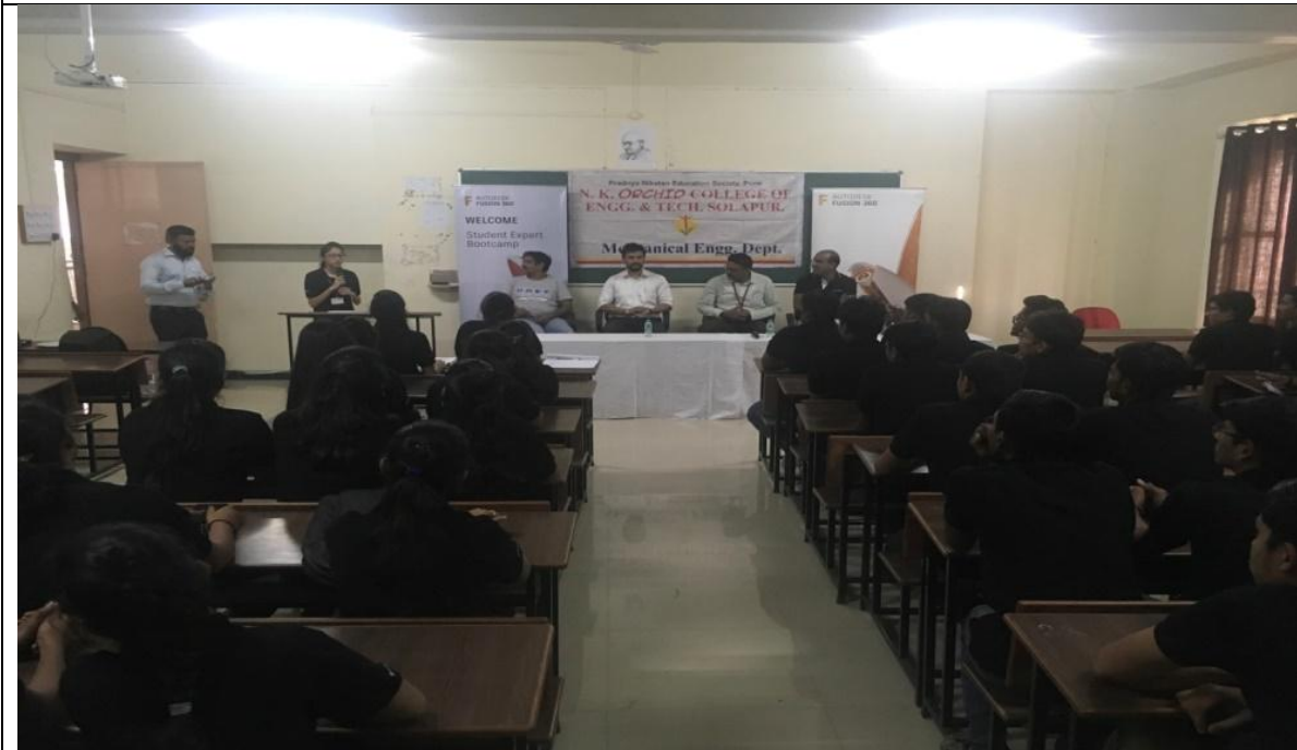
Boot Camp for S.E. Students from DBATU "Product Design Engg"