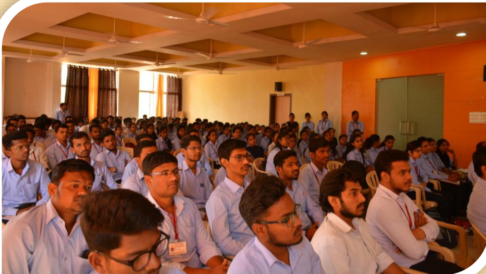
Placement Drive of Advik Hi-Tech, Pune