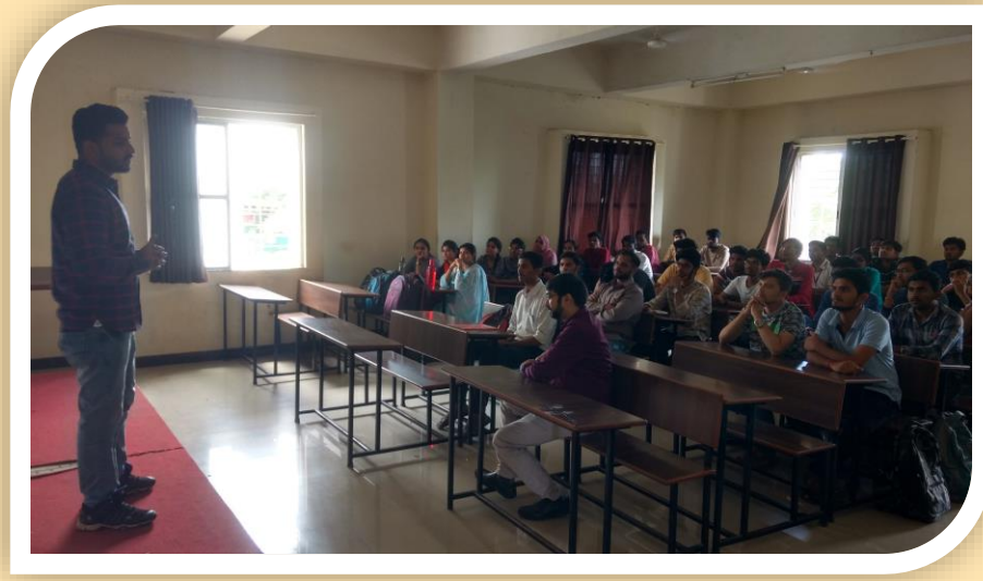
Experience Sharing Session by alumni