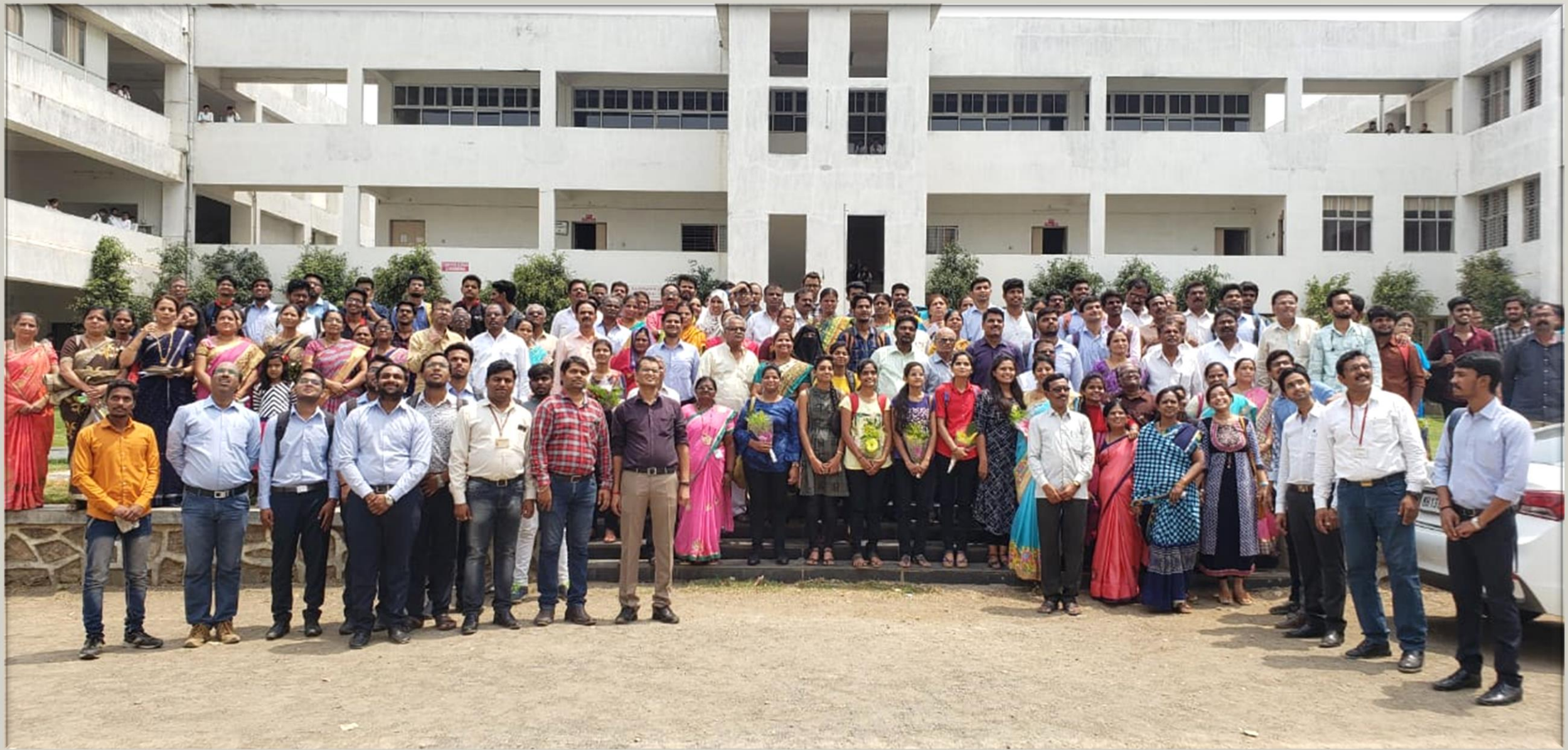
Placed Students, Satisfied Parents and faculty of Mechanical Department