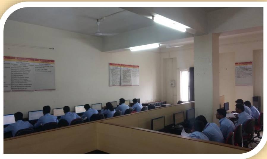
Aptitude Test of a Software MNC