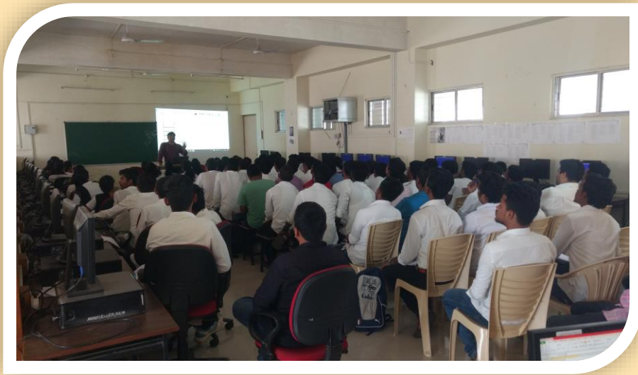
Training Session by Giri's Tech Hub, Pune