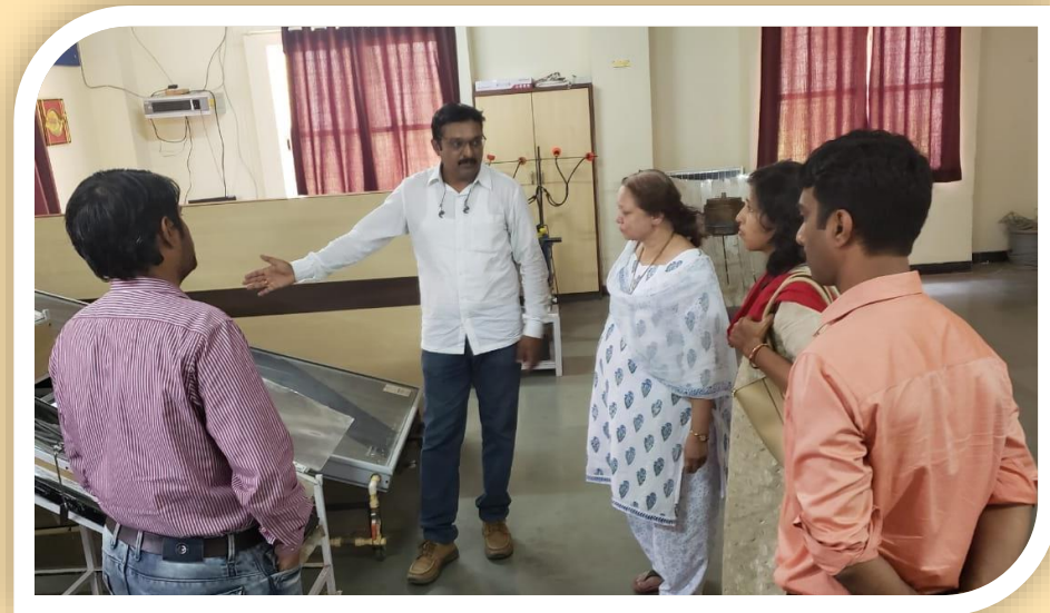
Placement Team of Electral Devices, Pune