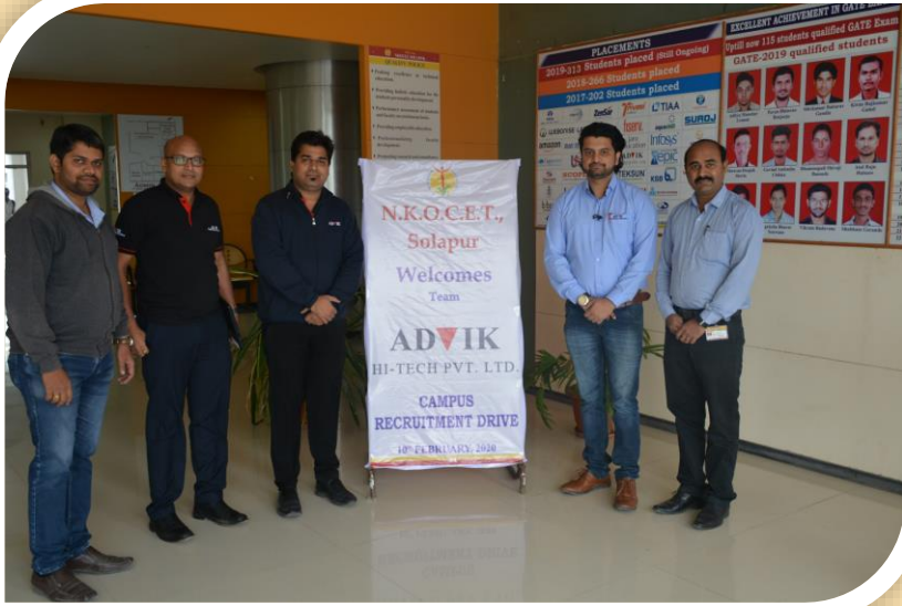
Placement Drive of Advik Hi-Tech, Pune