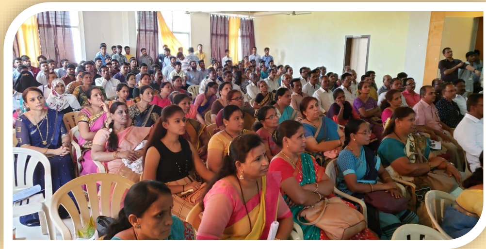
Felicitation of Parents of Placed Students